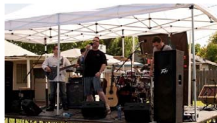
Band R8:2 Great Worship music!