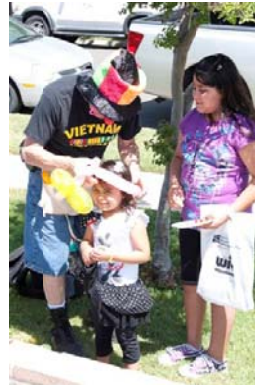
The Balloon Man was a favorite with kids.

So I hope this brings as much GOD into your heart, as it surely does to mine!